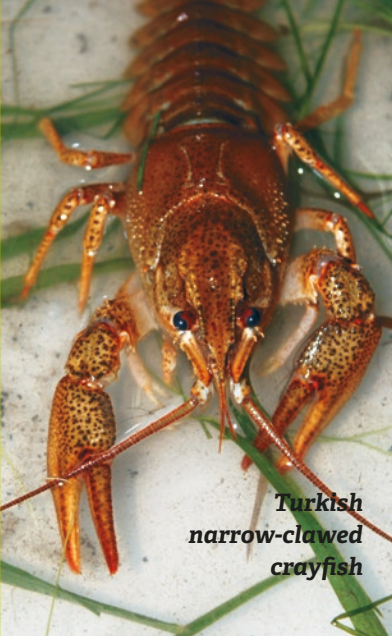
Turkish narrow-clawed crayfish