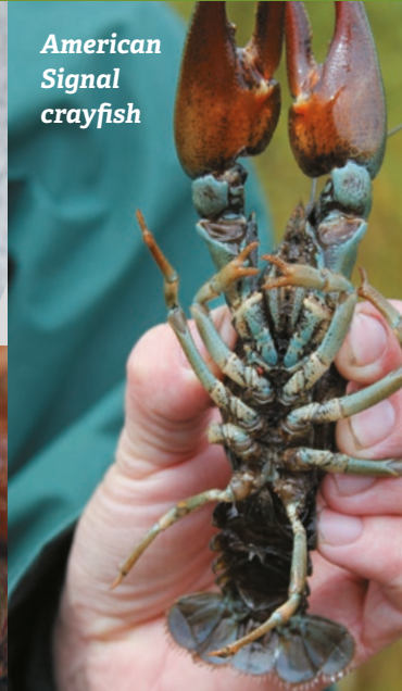
American Signal crayfish