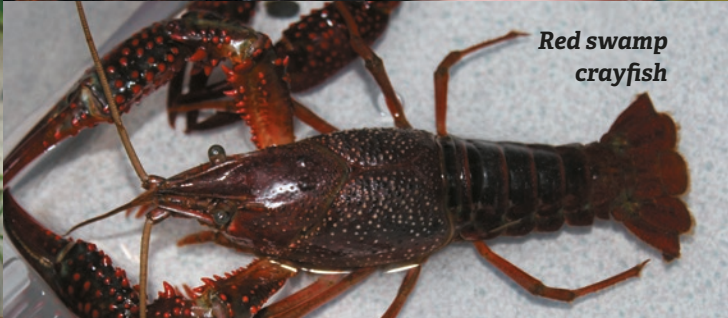
Red swamp crayfish