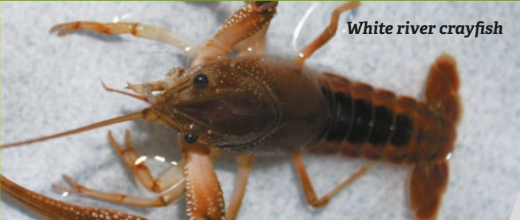
White river crayfish

Several non-native species have been confirmed in Britain so far: